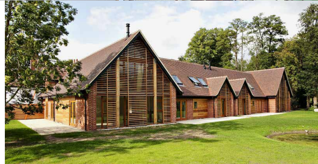
Residential : Donnington Estate, Berkshire