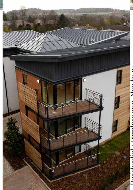
Residential : Maplespeen, Newbury