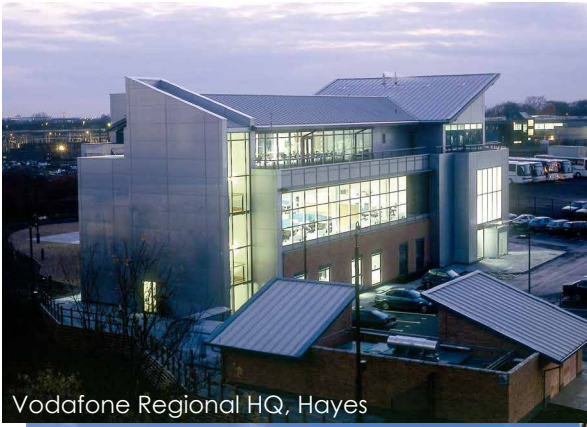
Vodafone Regional HQ, Hayes