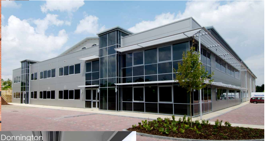
Offices : Norma HQ, Greenham Business Park, Newbury