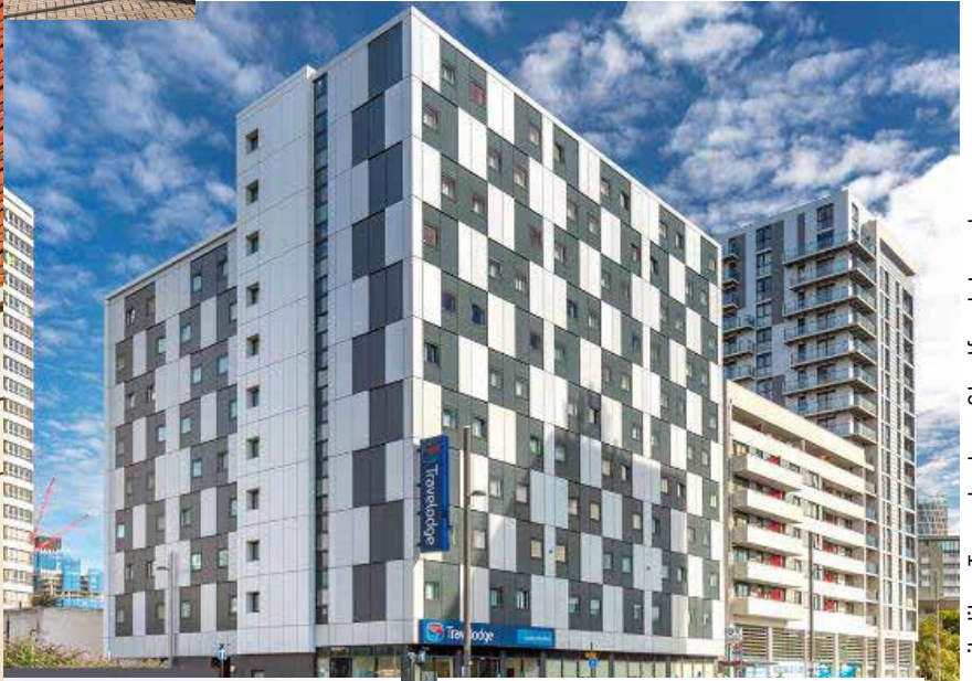
Hospitality : Travelodge, Stratford, London