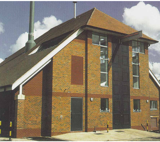
MAFF Facilities : Winchester