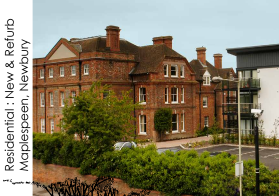
Residential : New & Refurb Maplespeen, Newbury