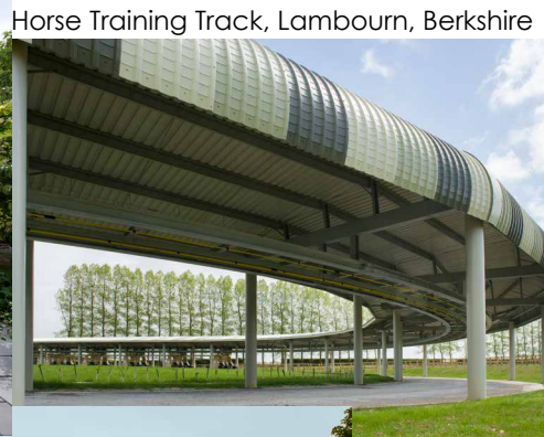
Horse Training Track, Lambourn, Berkshire