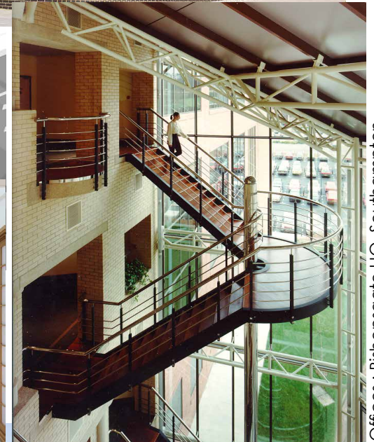
Offices : Bishopsgate HQ, Southampton