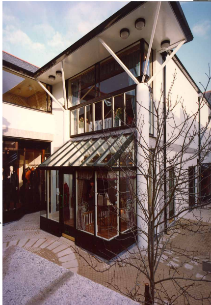
Retail Court, Pydar Street, Truro