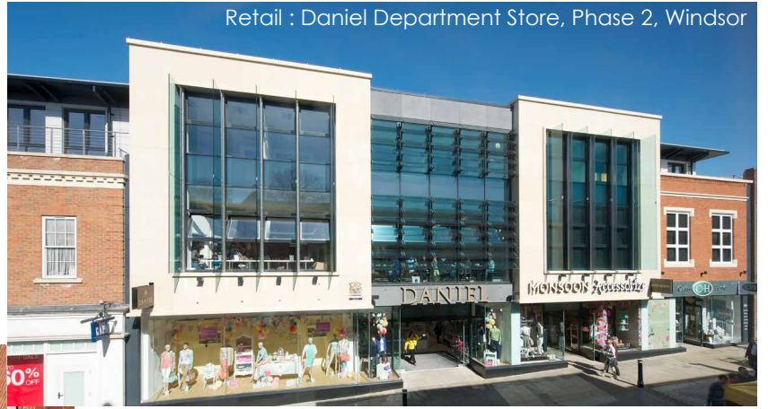
Retail : Daniel Department Store, Phase 2, Windsor