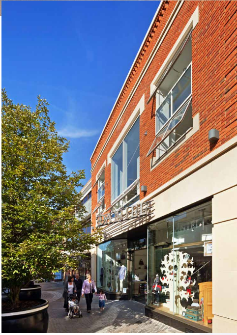
Retail : Daniel Department Store, Phase 1, Windsor