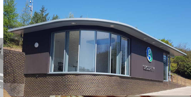
Security Lodge, Greenham