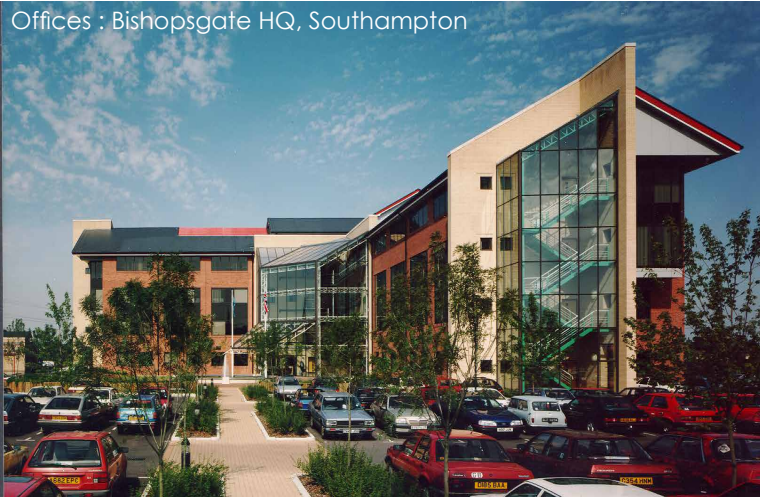
Offices : Bishopsgate HQ, Southampton