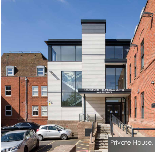
Strawberry Hill Medical Centre, Newbury