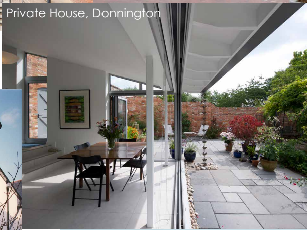
Private House, Donnington