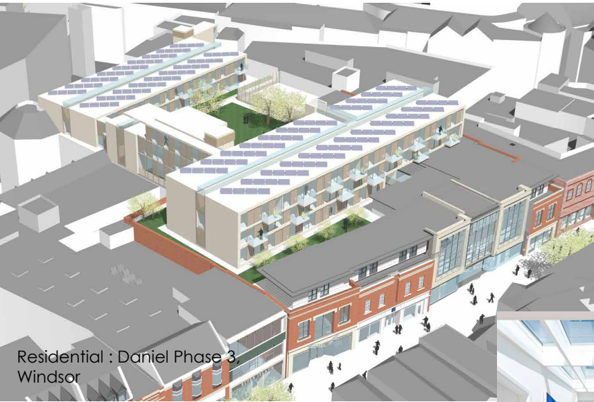
Residential : Daniel Phase 3, Windsor