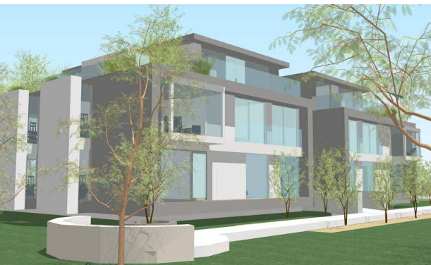
Residential : Abingdon