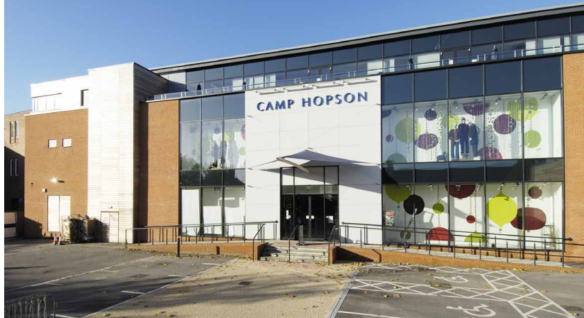
Retail : Camp Hopson Department Store, Newbury