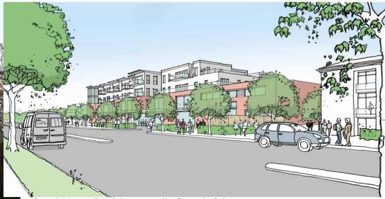
Mixed-Use : East Barnwell, Cambridge