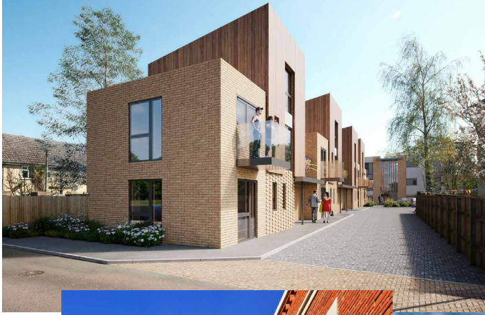
Residential : Malta Road, Cambridge