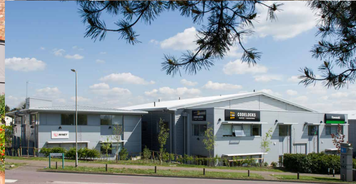
Offices & Industrial : Greenham Business Park, Newbury